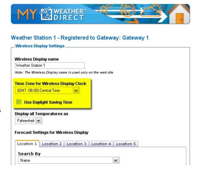
Page 9 of 25

The Time Zone you select on www.weatherdirect.com for your Wireless Display is intended to set the time for your physical location so the clock on your Wireless Display is accurate. This time is independent of your selected forecast locations. The Wireless Display will ONLY display the time from the "Time Zone for Wireless Display Clock" set on the web site, NOT the time at the forecast locations. There is only one Time